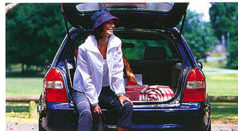
With Astina, life can be a picnic.

Anything goes in a Mazda Astina, eight days a week.