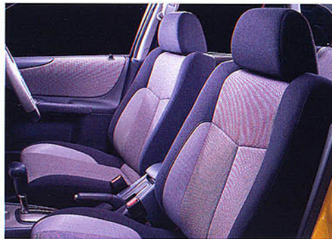
Your cockpit. Go play.

From any angle, it's sharp as a razor. And we don't mean a scooter.