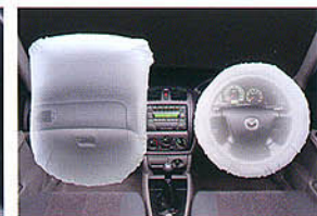
You can't see them, but they're there.