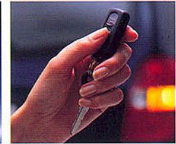
Touch, and go.