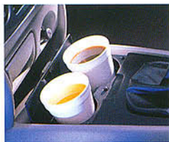
Drinks to go.