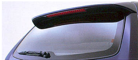
One of Astina's distinguishing features.

If your ideal car is one that combines fashion sense and common sense, Astina has long been the smart choice. And it's just become a whole lot savvier. From its appealing fresh new face, to its trademark roof spoiler and cheeky rear, it's the slick and stylish way to get around. (Even the wheel arches have flair.) Tinted glass all around lends a touch of privacy. While four-speed integrated air-conditioning adds an air of calm, so you can breathe easy.