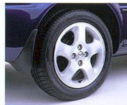
And the 1.8 wears alloys.

Power steering, windows and mirrors all make your day a little easier. And remote central locking, to all five doors, saves you yet another one of those small chores. Astina's lively personality shines inside as well. With fabrics, finishes and fittings that are as great to look at, as they are easy to live with. And because there are smarter ways to spend your money, all three Astina's engines are very savvy at the petrol pump.