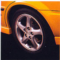
Alloys and underspoiler give it away.

If Astina is savvy style, then Astina SP20 is pure streetwear. A little more extreme.