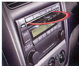
Every Astina now plays CDs.